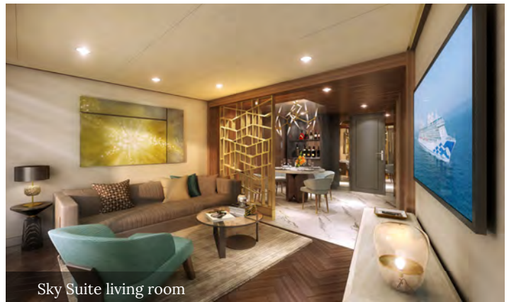
Sky Suite living room