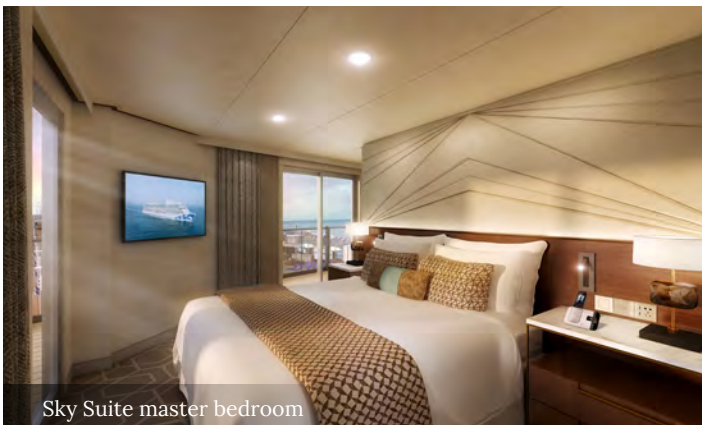
Sky Suite master bedroom