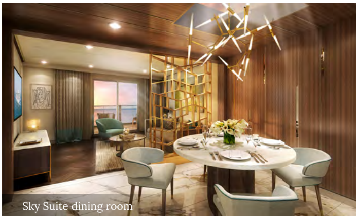
Sky Suite dining room

Introducing Sky Suites: Entertain. Celebrate. Reach for the sky. Sail with VIP treatment on Sky, Enchanted and Discovery Princess in our most premium suites yet. Relax in your home away from home – two bedroom, two bathroom suites equipped with the Princess Luxury Bed and an over 1000-square-foot continuous balcony. Feel on top of the world as you take in 270-degree panoramic views. Enjoy unparalleled service from the moment you book with a pre-cruise concierge and a seamless curb-to-suite experience.