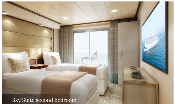
Sky Suite second bedroom