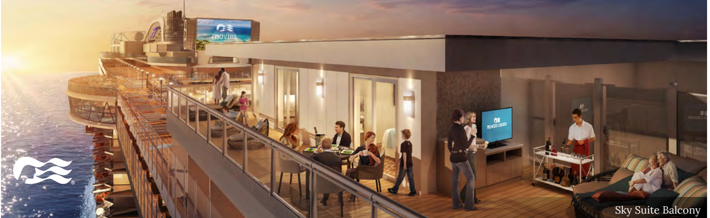
Sky Suite Balcony